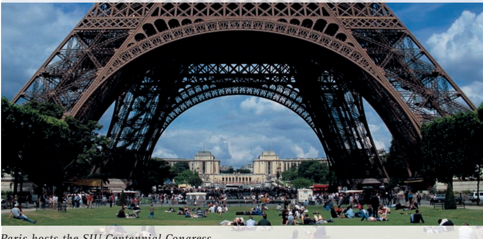
Paris hosts the SIU Centennial Congress