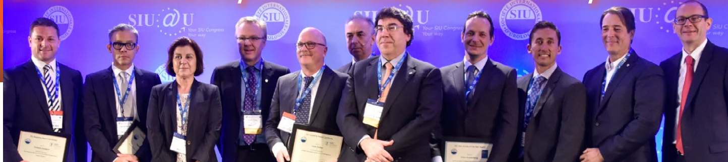
Award winners and members of SIU Academy Governance at SIU 2016 in Buenos Aires.

SIU Academy is an important educational resource for many urologists around the world, and it is through the contributions of various experts in a many different fields that we can continue to offer the highest-calibre content to our users. Users were asked to nominate the best content at the beginning of 2015, and the winners were announced in May 2015. Awards were distributed during the SIU 2016 Congress in Buenos Aires this past October.